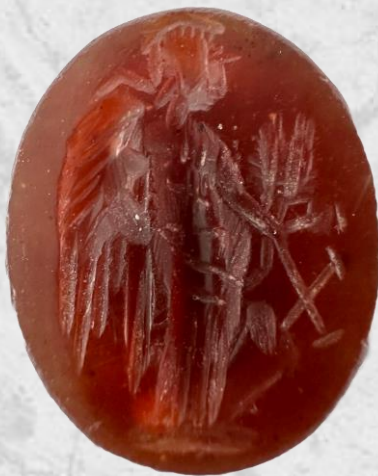
Semiprecious gemstone depicting Fortuna Panthea. Abdera, South Enclosure, chance find (MA 3981)